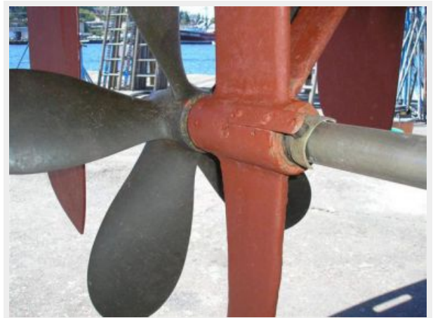
Cutlass Bearing w/Bonding System