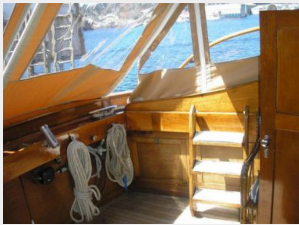
Enclosed Aft Deck to Port