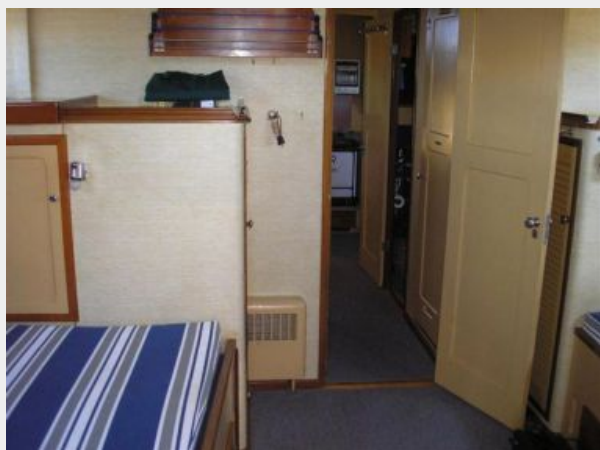
Master Cabin Looking Forward